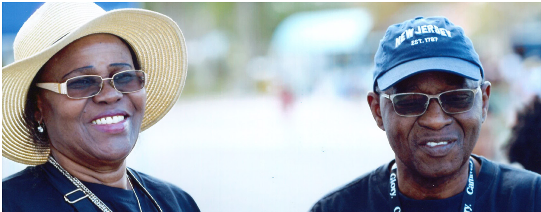
The Toguns on a cruise