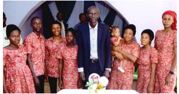
Pastor with church choir