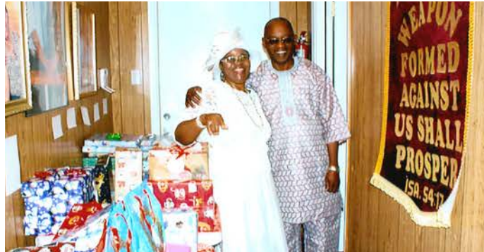
Christmas celebration at Christlove church