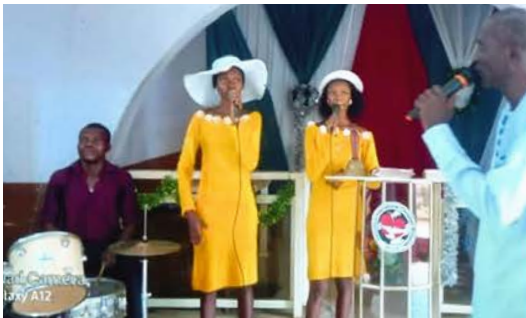
Guest Singers at the 9th anniversary