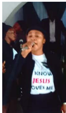
9th Anniversary Concert