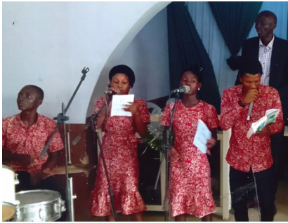
9th Anniversary Concert

CHRISTLOVE CHURCH IBADAN, NIGERIA 9TH ANNIVERSARY