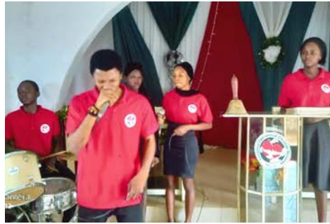
9th Anniversary Concert