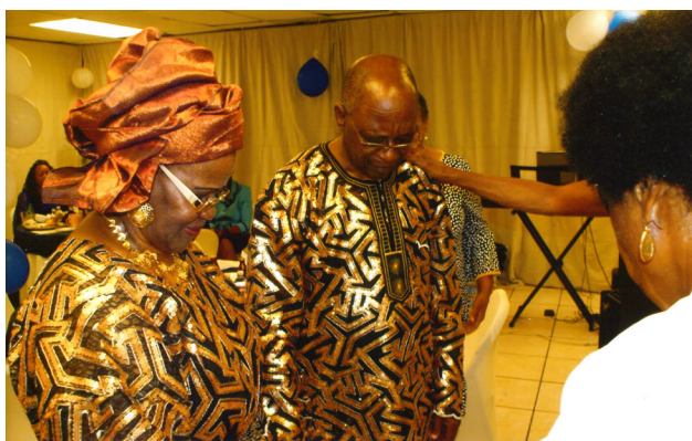
Praying for the celebrants