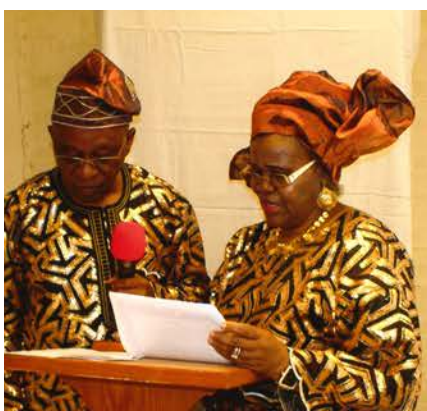
A duet by the celebrants