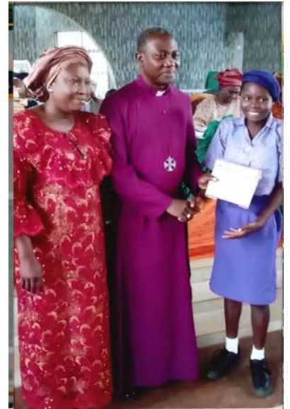
Nigerian High School student being sponsored by our son