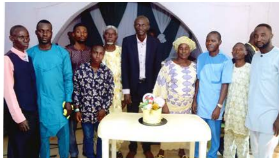
Pastor, church workers