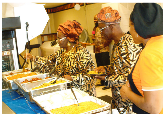
Time to eat!