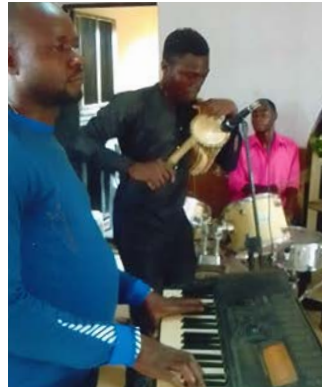
9th Anniversary Concert