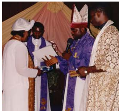
Mission to Port Harcourt, Nigeria